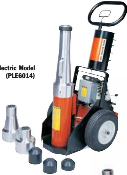
Electric Model (PLE6014)