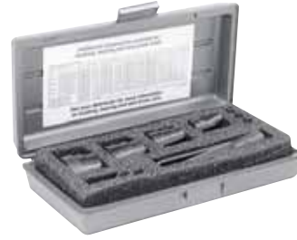
27797 Master Set (Board not included)