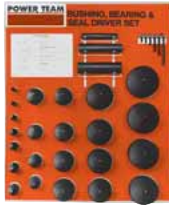
No. 27793 Starter Set