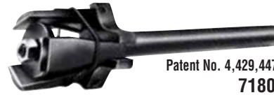
Patent No. 4,429,447 7180